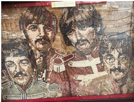
The Beatles made out of Jellybeans